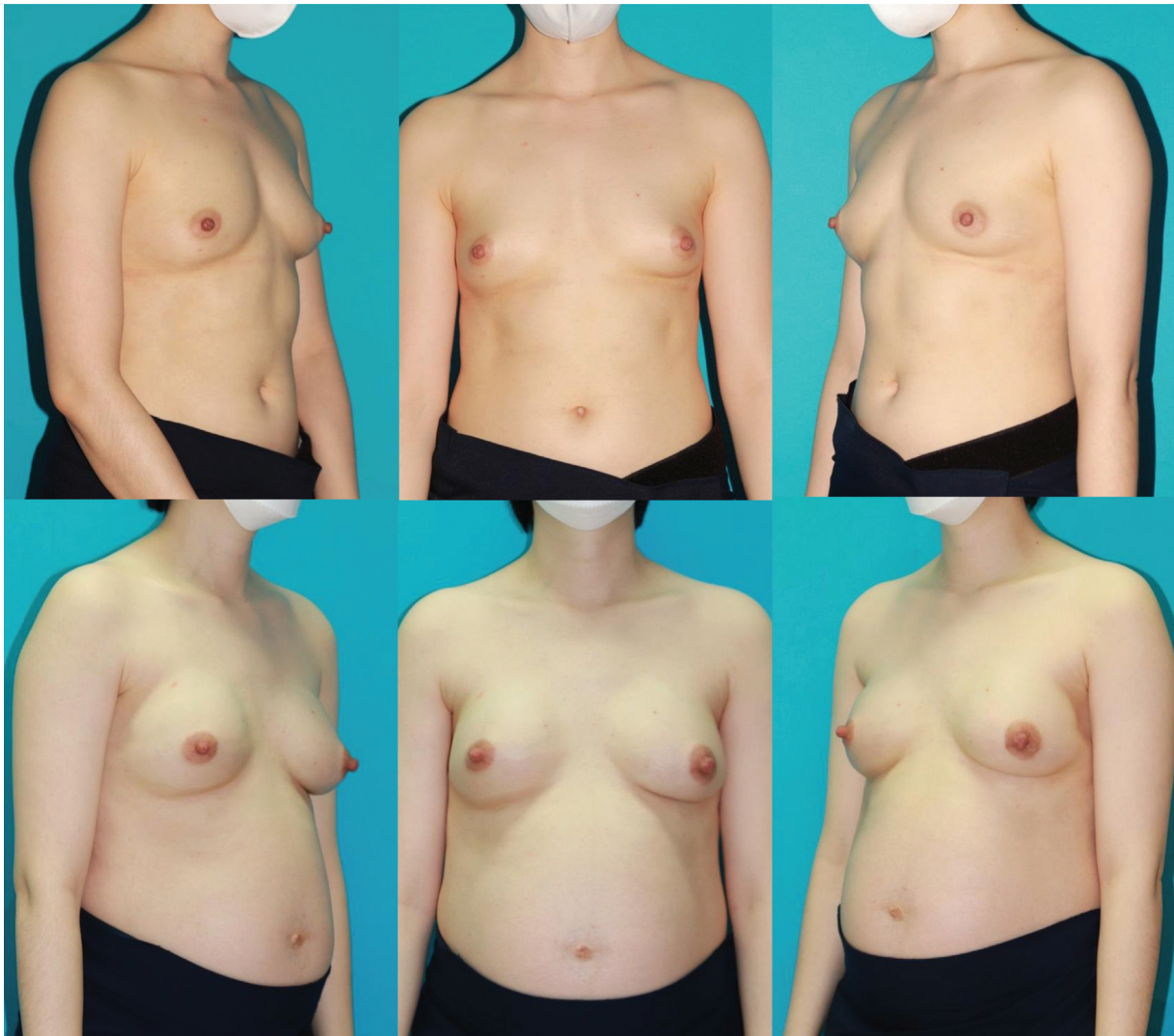
Fig. 3 A 32-year-old patient after a bilateral robot assisted nipple-sparing mastectomy through a longitudinal midaxillary line approach for invasive ductal carcinoma (pT1pN0M0) of the right breast and a prophylactic nipple-sparing mastectomy of the left breast after immediate prepectoral DTI with the superior coverage technique. (above: preoperative appearance; below: postoperative appearance at 1 year).

However, if the oncologic surgeon prefers an inframammary fold incision when performing mastectomy, then the superior coverage technique may be difficult to implement due to a poor visual field.