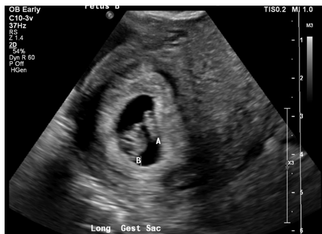
Fig. 1 Ultrasonographic evidence of intrauterine twin gestation (A, B).

After counseling, the patient underwent an uncomplicated diagnostic laparoscopy, left salpingectomy, and evacuation of hemoperitoneum ( \rightarrow Fig. 3 ). Intra-abdominal entry was performed via a transumbilical Veress needle. Insufflation was performed to an intra-abdominal pressure of