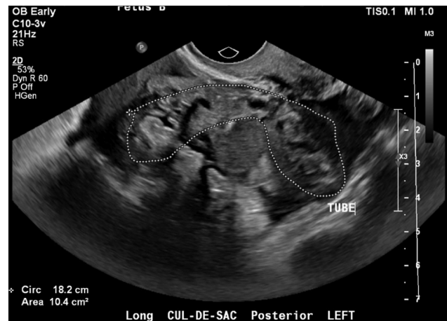
Fig. 2 Evidence of an enlarged left fallopian tube (“TUBE”) with complex, free fluid in the posterior cul-de-sac.

15 mm Hg and three laparoscopic 5 mm ports were placed in bilateral lower quadrants. Given the IUP, uterine manipulator was avoided to minimize risks of disrupting the desired IUP. She recovered well and was discharged on the same day. Final pathology confirmed left tubal ectopic pregnancy.