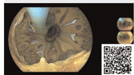
► Video 1 Successful treatment of anastomotic defect with VacStent (VacStent Medtech AG, Steinhausen, Switzerland).