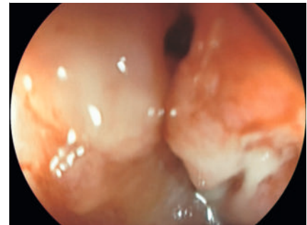
► Fig. 1 Anastomotic defect.