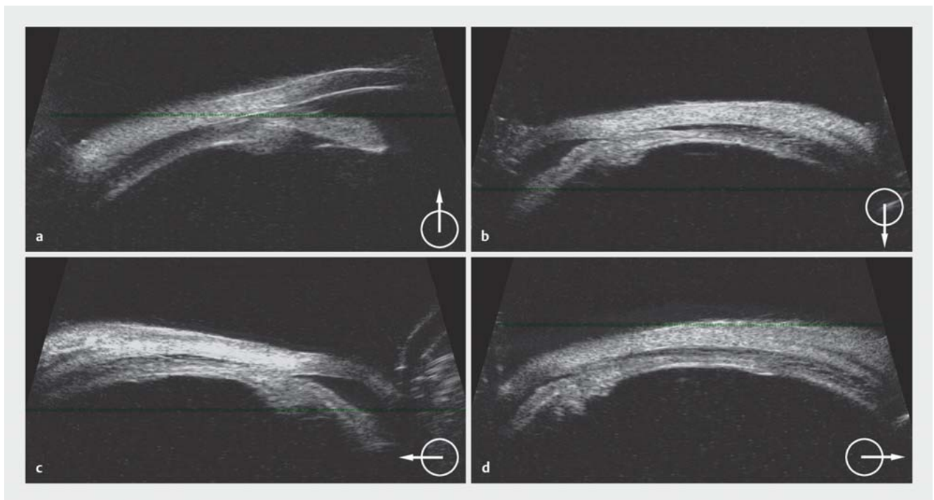
► Fig. 1 Circumferential ultrasound biomicroscopy (48 MHz): anterior uveal effusion associated with iridocorneal angle narrowing/closure (RE).

An anterior ciliary body rotation with displacement of the iris-lens diaphragm, an extremely rare complication of acetazolamide, was suspected and the patient was admitted for monitoring because of the risk of angle closure. Twelve hours later, his myopia had progressed to -5.5\text{D} with angle closure while intraocular pressure (IOP) remained normal at 12 mmHg (RE) and 13 mmHg (LE). A bilateral circumferential anterior uveal detachment was revealed on ultrasound biomicroscopy (► Fig. 1). In order to reverse the anterior ciliary body rotation, cycloplegia was initiated with atropine 0.5% bid associated with topical dexamethasone 0.1% qid. The evolution was favorable, with a progressive deepening of the anterior chambers, reopening of the iridocorneal angle (► Fig. 2), and complete resolution of the myopic shift after 5 days. Best-cor-