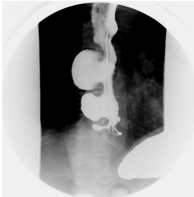
Fig. 1 View of barium esophagogram showing multiple diverticula.

Endoscopy_UCTN_Code_CCL_1AB_2AC_3AF Endoscopy_UCTN_Code_CCL_1AB_2AC_3AH