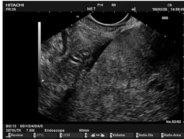
Fig. 1 Conventional B-mode imaging showed diffuse liver disease and ascites.

Contrast-enhanced endoscopic ultrasound demonstrated peripheral rim enhancement of a liver lesion, which was shown histologically to be a metastasis of a neuroendocrine tumor of the pancreas. (See also ● Fig. 2.)