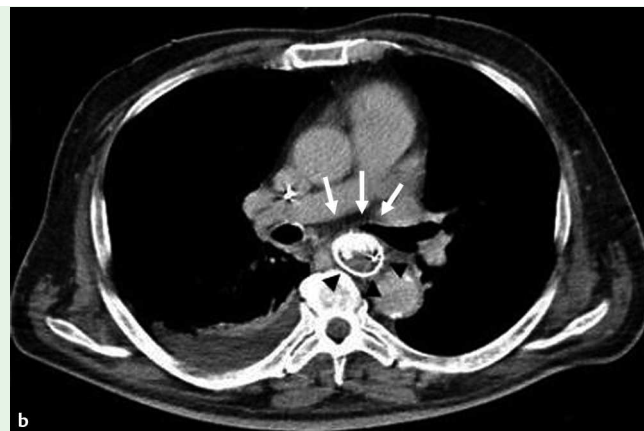
Fig. 2 Bronchoscopic view of left main bronchus with luminal impression of the esophageal stent. b CT scan of the thorax at the level of the tracheal bifurcation showing compression of the left main bronchus (white arrows) by the esophageal stent (black arrowheads).