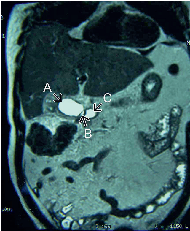
Fig. 3 Coronal section of magnetic resonance image showing “pseudo” gallbladder (A), “pseudo” cystic duct (B), and normal duodenum (C).