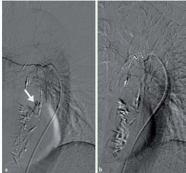
Fig. 2 Selective right bronchial arterial embolization. a Contrast media leaked from the small branch of the right bronchial artery (arrow). b After coil embolization, the bronchial artery was occluded and no dye leakage was seen.

Although the majority of Mallory-Weiss tears resolve spontaneously, rare cases of severe, active bleeding may be fatal if left untreated [1]. In our case, the laceration site was relatively long for a Mallory-Weiss tear. Interestingly, the artery feeding the esophageal laceration was the right bronchial artery around the middle esophagus, instead of the left gastric or splenic artery [2]. Therefore, if one cannot find the feeding artery in Mallory-Weiss