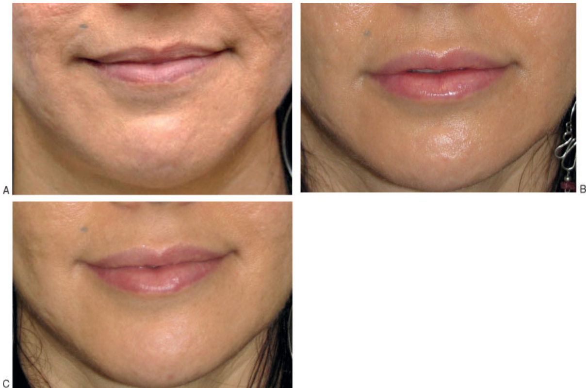
Figure 4 Autologous fat transfer to the lips. Fat was mixed with PRFM in a 2:1 ratio. (A) Pretreatment; (B) 1 week after treatment; (C) 4 weeks after treatment, with little volume loss compared with 1 week posttreatment.

tethering the base of the acne scars are lysed by sweeping the needle and using the sharp edge to cut through these fibers. Without removing the needle from the skin, the PRFM is then injected into the subdermal plane below the acne scars: 2 cc to 4 cc PRFM is