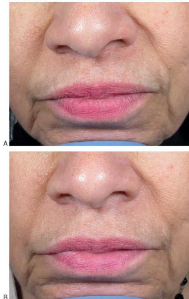
Figure 2 Typical improvement seen after a single Selphyl PRFM treatment of the nasolabial folds. (A) Pretreatment; (B) 12 weeks after treatment.

Treatment of Acne Scars Broad-based, atrophic acne scars can be difficult to treat without significant morbidity, and even with invasive procedures such as dermabrasion, results can be disappointing. Acne scar subcision attempts to divide any fibrous bands tethering the base of the scar to the subdermal tissues using a