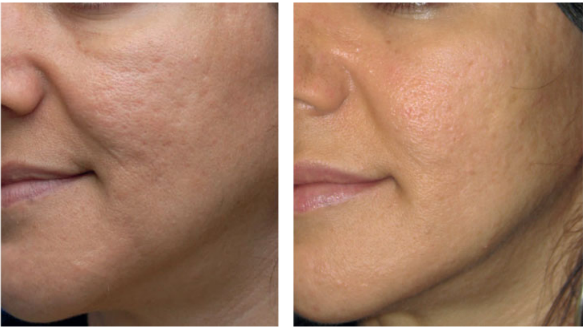
Figure 3 Atrophic acne scars can be treated with subcision and PRFM injection below the subcised scars. (A) Pretreatment; (B) posttreatment.

Nocor needle (Becton, Dickinson & Co., Franklin Lakes, NJ). This technique has been modified to allow for restructuring of the subdermis. A 19-gauge needle is placed on a 3-cc syringe filled with PRFM. The needle is passed through the skin, and the subdermal bands