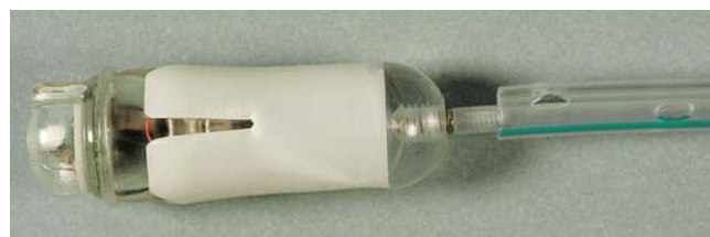
Fig. 3 SmartPill inserted into the cup holder.