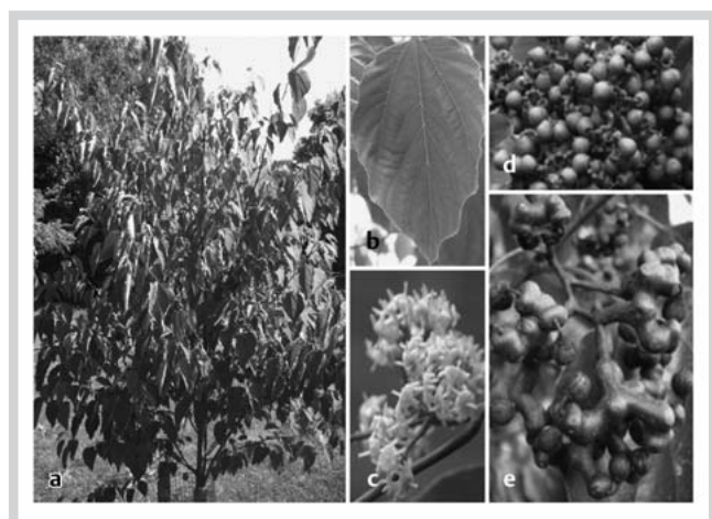
Fig. 1 Hovenia dulcis Thunb. (Japanese raisin tree) is characterized by broadly ovate, glassy dark green foliage and sweet, fleshy and swollen peduncles. a Hovenia dulcis Thunb, b leaf, c flower, d unripe fruit, and e ripe drupes. Source for c , d , e : http://www.hovenia.com .

cohol concentration in the blood [4, 10, 11]. In addition, several patent applications have been filed based on different pharmaceutical applications of H. dulcis , in particular those related to treatment of acute alcohol poisoning [12–15].