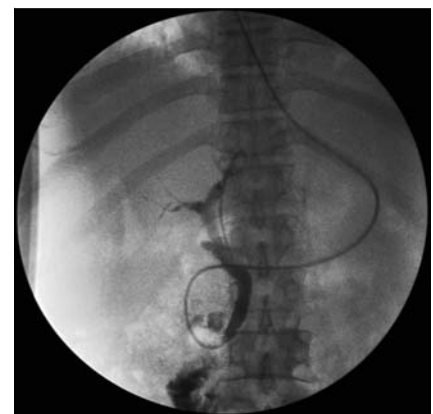
Fig. 4 Cholangiography two weeks later (via endoscopic nasobiliary drainage) did not show any extravasation of contrast medium.