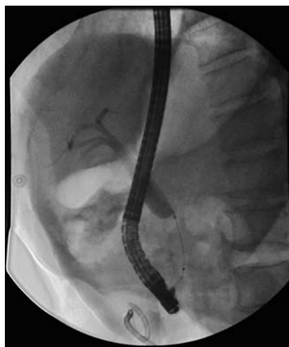
Fig. 3 Endoscopic retrograde cholangiography (ERC) showing extravasation of contrast medium from the gallbladder into the perihepatic area.