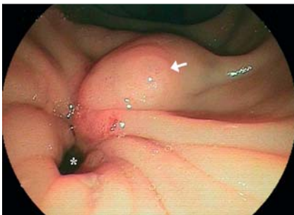
Fig. 4 ERCP duodenoscopic view showing a duodenal luminal obstruction with contracted mucosal folds (asterisk) and a prominent minor papilla (arrow).