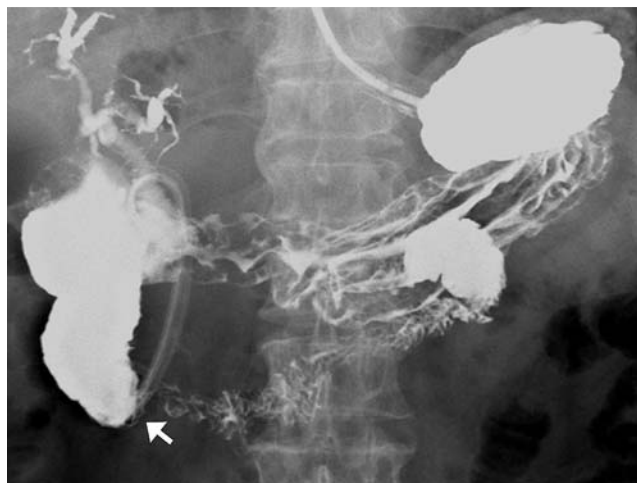
Fig. 2 Contrast study with Gastrografin showing luminal obstruction in the second portion of the duodenum at the papillary level (arrow).

sies during the ERCP sessions, which enabled us to rule out malignant stricture. Although it is difficult to give an exact explanation of which additional potential pathogenic factors might be involved in a rare case, we suggest that the extensive inflammation of the duodenal papilla due to the impacted stone may have had a role in