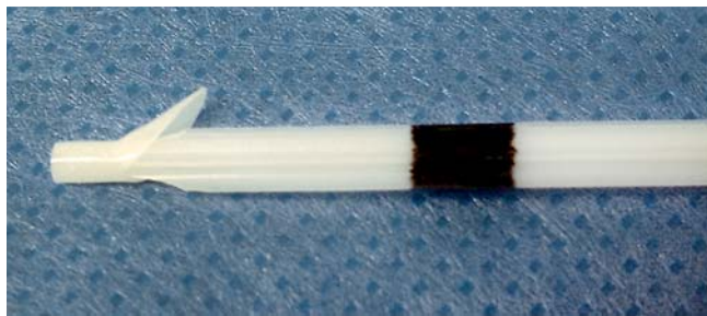
Fig. 1 Wing stent (10 Fr, 12 cm) with soft pliable retention flaps and a radiopaque black marker for accurate stent placement. The stent channels fluid along its winged perimeter, which may increase its patency rates.

The primary disadvantage of conventional plastic biliary stents is their short patency rate [1], as they are prone to biofilm build-up within the central lumen of the stent, resulting in impaired bile flow [2]. The wing stent (ViaDuct; GI Supply, Camp Hill, Pennsylvania, USA) was engineered to overcome this problem (► Fig. 1).