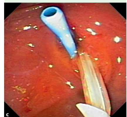
Fig. 2 a After the wing stent is placed in the bile duct, the wire is placed in the channel between two wings of the stent. b The wire is then advanced into the bile duct. c A second stent can subsequently be placed without difficulty over the wire in standard fashion.