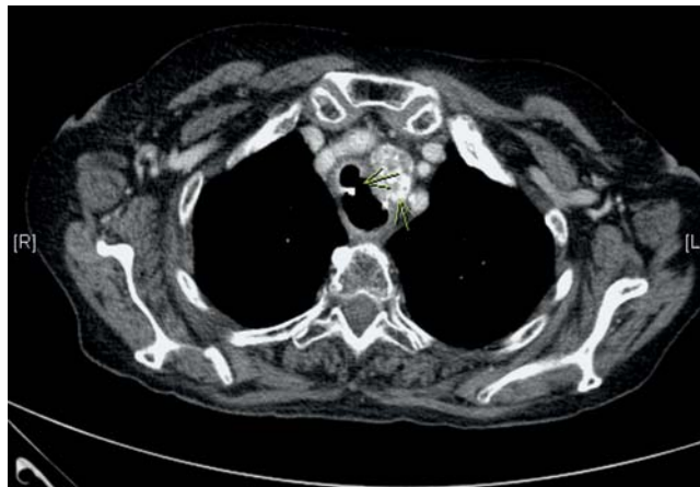
Fig. 2 Computed tomography (CT) scan showing a tracheoesophageal fistula on the upper edge of the stent.

Only a little granulating tissue was present at the stent site and there was no evidence of stent degradation. A computed tomography (CT) scan performed on the same day, however, revealed a tracheoesophageal fistula at the upper end of the stent (● Fig. 2) without evidence of tumor recurrence.