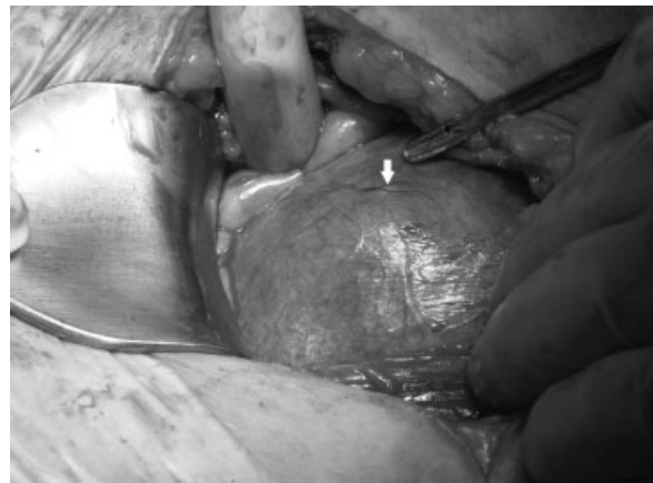
Figure 3 Uterine scar dehiscence during repeat cesarean. Lower uterine segment after opening of the parietal peritoneum (case 1). Particles of fetal vernix (white arrow) and fetal parts can be visualized through complete uterine scar dehiscence.

time, she underwent labor induction with a Foley catheter and oxytocin because of severe preeclampsia and intrauterine growth restriction. Twelve hours after oxytocin initiation, no significant change in cervical dilatation was noted, and a cesarean was performed for a failed labor induction. The procedure was uneventful, and the hysterotomy was closed with a locking, continuous suture and an imbricating, continuous suture. Her LUS was measured at 36 weeks' gestation in her next pregnancy 3 years later. Transvaginal ultrasound did not reveal any evidence of uterine scar defect, and the LUS measured 2.7 mm (Fig. 2A). However, the transabdominal approach showed a LUS thickness less than 2.0 mm, ~11 cm from the cervical os (Fig. 2B). Elective repeat cesarean was undertaken at 39 weeks' gestation before labor. During surgery, a very thin LUS was observed, with vernix caseosa and the fetal part visible through complete uterine scar dehiscence (Fig. 3).