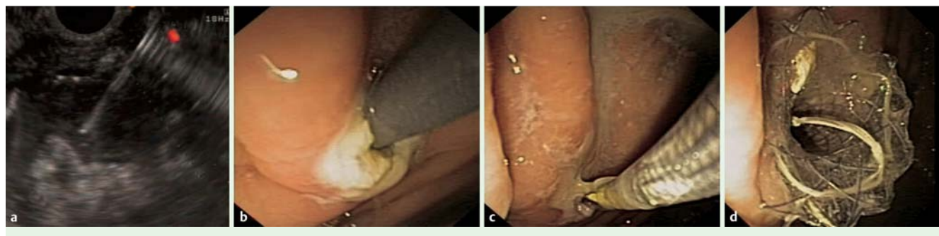
Fig. 1 a Endoscopic ultrasound-guided puncture in a 53-year-old man with a pancreatic pseudocyst. b Fistula created by pre-cut. c A covered self-expandable metal stent (CSEMS) on the guide wire. d The CSEMS observed from the stomach.

ear array echoendoscope (GF-UCT140; Olympus America Corp., Melville, New York, USA), a transgastric puncture with a 19-gauge needle (EUSN-19-T; Wilson-Cook Medical, Winston-Salem, North Carolina, USA) was made under EUS with Doppler guidance. A 0.035-inch wire (Jagwire, Microvasive Endoscopy, Boston Scientific, Natick, Massachusetts, USA) was positioned in the cavity, and a precut was done to create a fistula. A new CSEMS (2cm in length and 10mm in diameter) with large flares (3 cm in diameter) at the extremities (Niti-S ComVi fully covered biliary stent, Taewoong Medical, Gyeonggi-do, Korea) was placed, with immediate drainage of pus (> Fig. 1, • Fig. 2). The patient promptly recovered and no longer had fever. A CT scan after 10 days showed resolution of the pseudocyst. A gastroscopy conducted 3 months later showed that the CSEMS was correctly placed and patent. It was easily removed with a snare and the patient has not experienced any further problems.