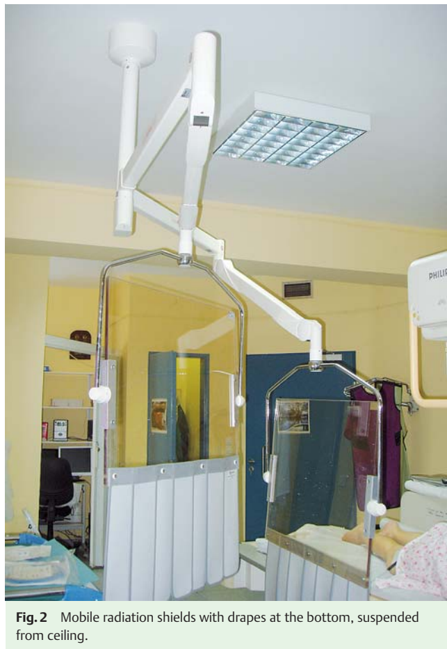
Fig. 2 Mobile radiation shields with drapes at the bottom, suspended from ceiling.

There are no trials available regarding this issue but radiation-warning lights inside and outside the examination room are recommended; they must operate automatically [68]. Regulations