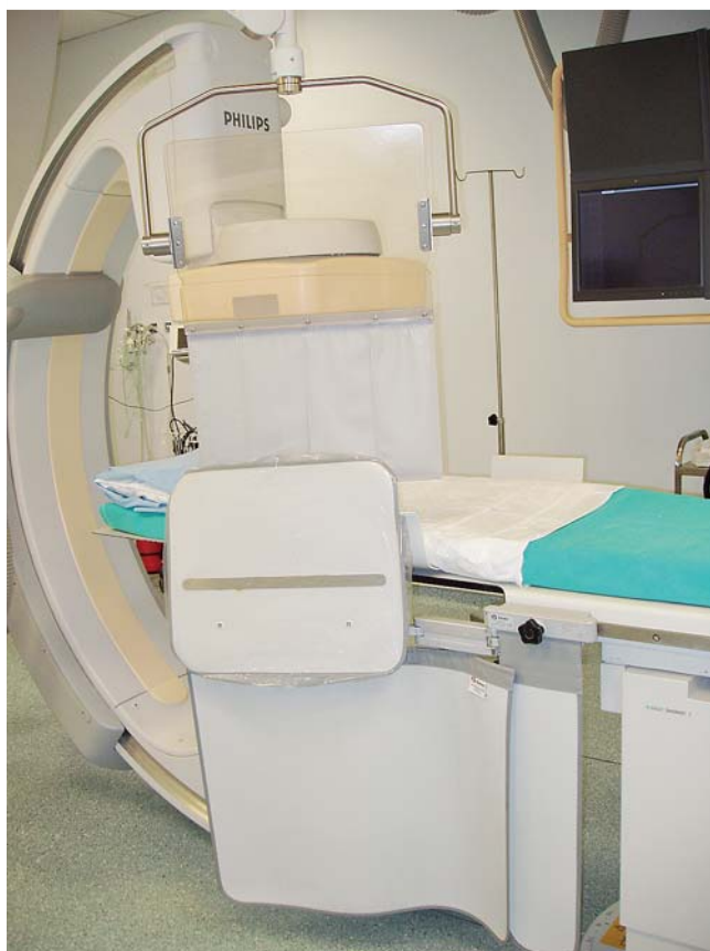
Fig. 3 Under-couch X-ray system with protective radiation shields placed under and over the table, to protect the endoscopist from radiation that originates from the X-ray tube and from the patient (scattered radiation), respectively.

about warnings that are activated when X-rays are being delivered vary considerably between EU countries (e.g., warning lights outside of the room are legally required in Greece). Doors leading into the X-ray room must have signs that indicate the presence of the X-ray unit. Notices that ask patients to inform about possible pregnancy should be posted at the reception area [69].