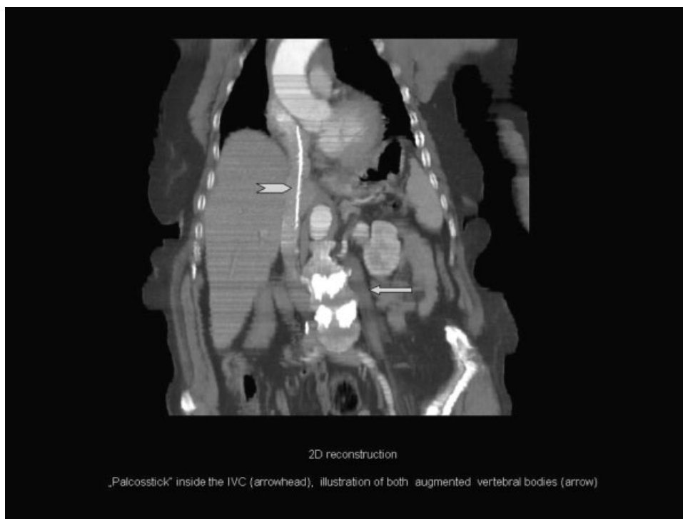
Figure 1 2D reconstruction: palacosstick inside the IVC, illustration of both augmented vertebral bodies.

transcatheter closure devices causing symptoms masquerading acute dissections. 2,3