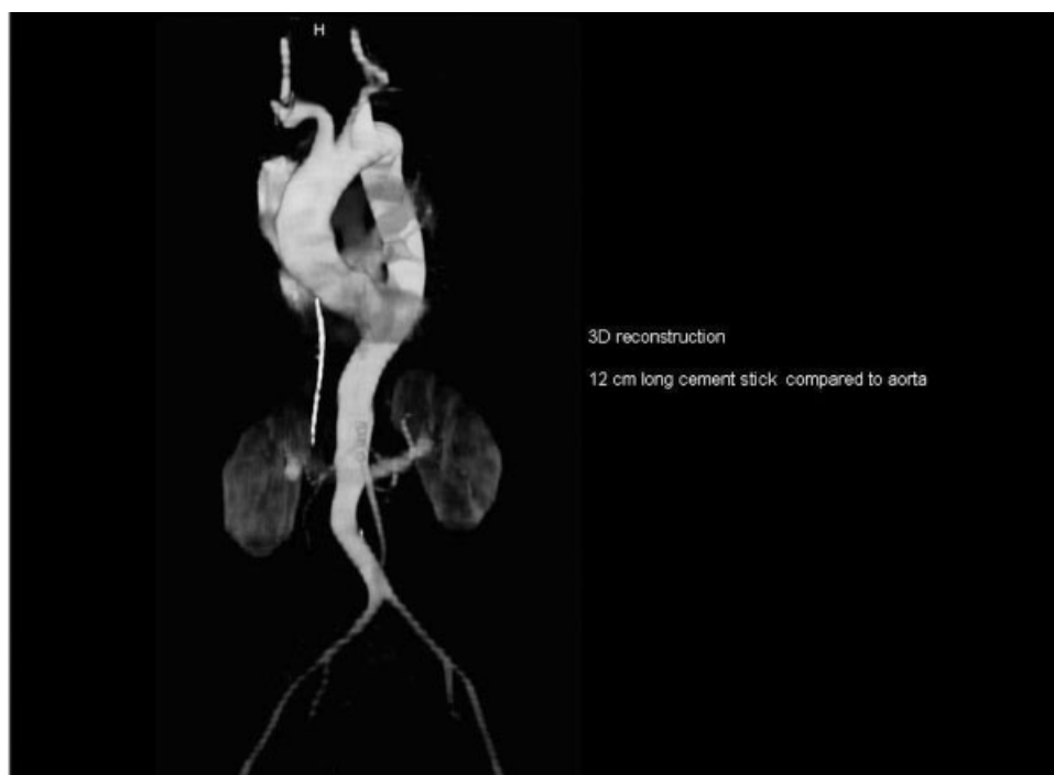
Figure 2 3D reconstruction: palacosstick compared with aorta.

presentation, the only possible reason for the cement finding in her body. The procedure is used for pain relief of osteoporotic vertebral body compression fractures. After percutaneous injections of palacos the material solidifies. This process generates temperatures as high as 70°C with the potential of causing tissue damage allowing leakage of bone cement into