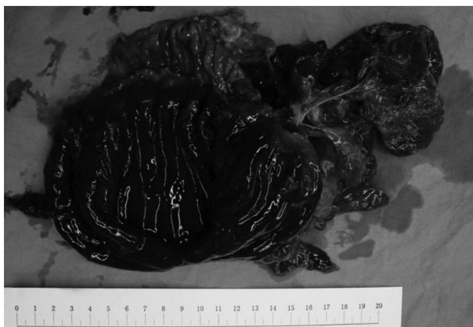
Figure 3 The opened, huge, dark-reddish strangulated stomach, 14 cm in maximal length, with blackish necrotic mucosae.

Traumatic diaphragmatic injury is a recognized consequence of high-velocity blunt and penetrating trauma to the