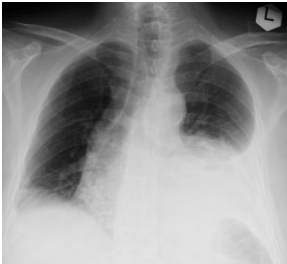
Figure 1 Chest roentgenogram showed left costophrenic angle blunting.