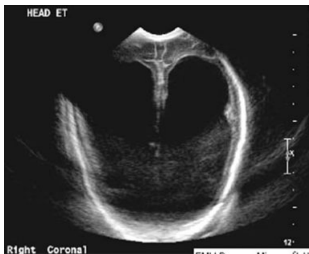
Figure 2 Cranial ultrasound from the infant in our case showing severe hydrocephalus. There remains discussion among the treating physicians as to the cause of the findings. Possible explanations include posthemorrhagic hydrocephalus, hydrocephalus ex vacuo, or a large porencephalic cyst. Regardless of the etiology, long-term developmental disability is expected.

confirmed as a cause of neonatal anemia by Chown in 1954. 2 It is now known that the placenta can be a conduit for movement of both nucleated cells and red corpuscles in a bidirectional fashion between the mother and fetus. 3 Laube suggested that fetal-maternal hemorrhage (FMH) was responsible for nearly 14% of unexplained fetal deaths and 3% of all fetal deaths. 4