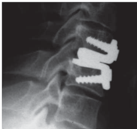
Fig 3 Prestige II disc replacement. This is a stainless steel metal-on-metal bearing articulating device with screw fixation into the vertebral body through the anterior plate.