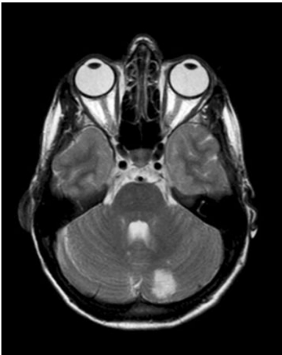
Figure 2 Brain MRI: infarction around the left cerebellar artery.

Conservative treatment is recommended for uncomplicated traumatic pneumatocele since they resolve spontaneously, but complete resection is recommended for all known complicated cases. 2 Systemic air embolism has a fatal outcome of ~80% in blunt chest trauma 8 ; hence surgical resection of pneumatocele through a thoracotomy is justified to remove the probable source of air embolism.