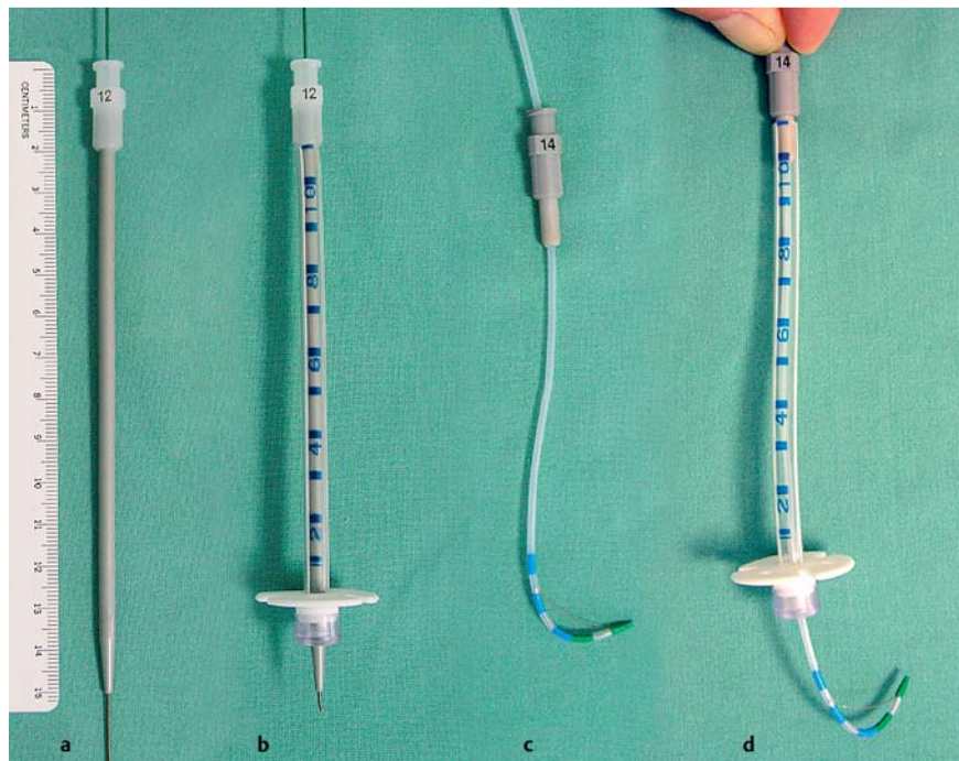
Fig. 1 Instruments required for releasing a buried percutaneous endoscopic gastrostomy (PEG) bumper using the novel technique described here. a Dilator with a guide wire. b Dilator with a guide wire introduced into the PEG cannula. c Cannulotome with a bushing part. d Cannulotome introduced through a PEG cannula.