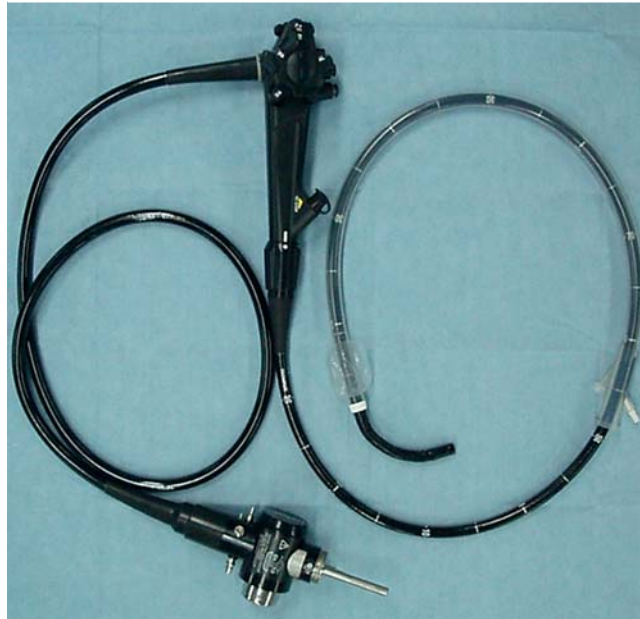
Fig. 1 Balloon overtube preloaded to the therapeutic colonoscope.

The average diameter of the specimens retrieved in our case series was 38.7mm, with an average tumor diameter of 32.4mm. The mean procedure time were 110 minutes. Both the complete resection rate and the en bloc resection rate was 100%. One perforation occurred during the ESD, but this was managed successfully with intravenous antibiotics (● Table 1). Although further studies are required to validate our findings, the newly developed overtube allowed us to use instruments such as a magnifying colonoscope with water-jet function and hood devices, all of which facilitated the colorectal ESD.