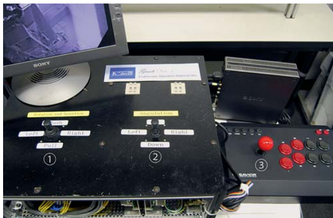
Fig. 3 The manipulation unit of the endoscopic operation robot (EOR) includes a monitor and three joysticks. The joystick on the left (1) controls tip rotation, extension, and retraction; the joystick in the center (2) controls the up–down and right–left angulation knobs; and the joystick on the right (3) controls extension and retraction of the insulated tip (IT) knife in the vertical axis and knife tip insertion and withdrawal in the horizontal axis.