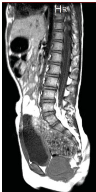
Fig. 2 Tailgut cyst displacing the bladder anteriorly and causing constipation.

polyp. The photo documentation led to more extensive preoperative examination including rectal examination during general anesthesia and a MR scan. The process was easily accessible through a suprasphincteric sagittal incision. Others