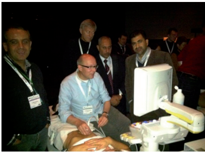
The Postgraduate Course on Ultrasound - A two-day pre-congress course with lectures and hands-on training.