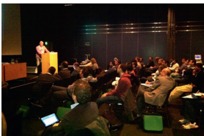
Three to four lunch lectures each day during the congress.