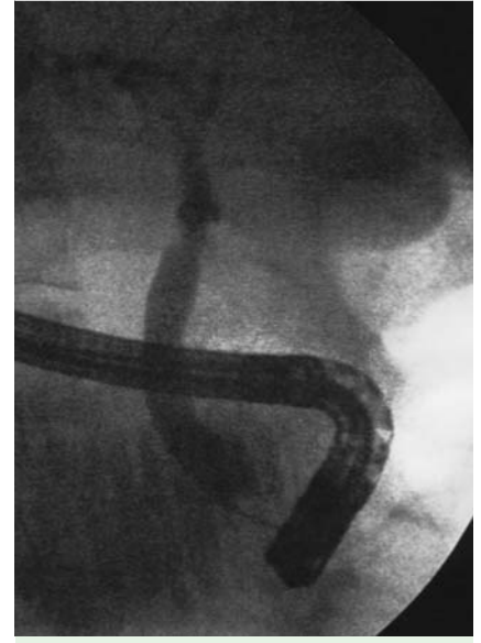
Fig. 2 The dilated lower bile duct.