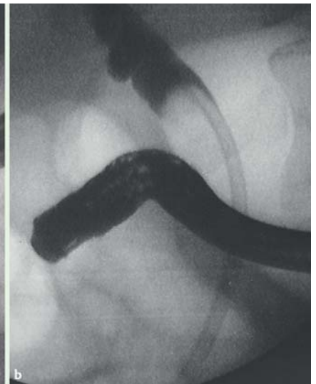
Fig. 3 a Clot obstructing the lower bile duct. b Plastic stenting through the clot.