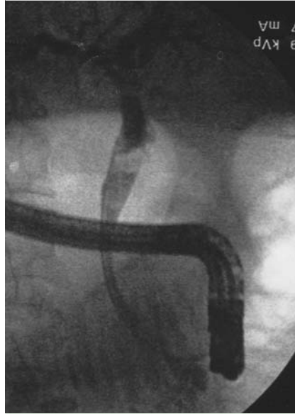
Fig. 1 Endoscopic retrograde cholangiography in a 45-year-old man with a symptomatic stone in the main bile duct: confirmation of stone and relative lower stenosis.