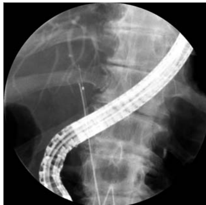
Fig. 4 Fluoroscopic image of the opened biopsy forceps alongside the tip of the "mini-cholangioscope" inside the biliary stricture.

Cholangioscopy has improved our ability to study diseases of the biliary tract and to provide therapy [1,2]. A prerequisite for cholangioscopy using available systems is the presence of common bile duct dilation and a previous sphincterotomy [1,2]. We present a modified technique for performing cholangioscopy in patients with a stenosed common bile duct and/or intact papilla.