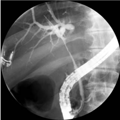
Fig. 1 Cholangiogram showing a tight stricture at the level of the common hepatic duct, Bismuth type I.