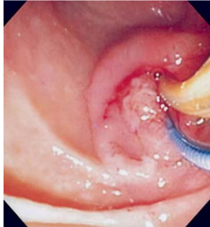
Fig. 3 Biopsy forceps introduced beside the "mini-cholangioscope".