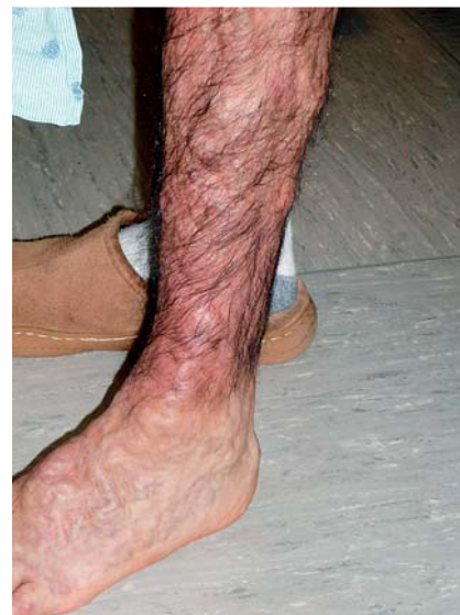
Fig. 1 Extensive varicose veins (unilateral) in left lower extremity of a 28-year-old Hispanic man passing bright red blood per rectum.

Department of Gastroenterology, Hepatology, and Nutrition MSB 4.234, 6410 Fannin University of Texas Medical School at Houston Houston TX 77030 USA Fax: +1-713-5006699 in2104@poh.osaka-med.ac.jp