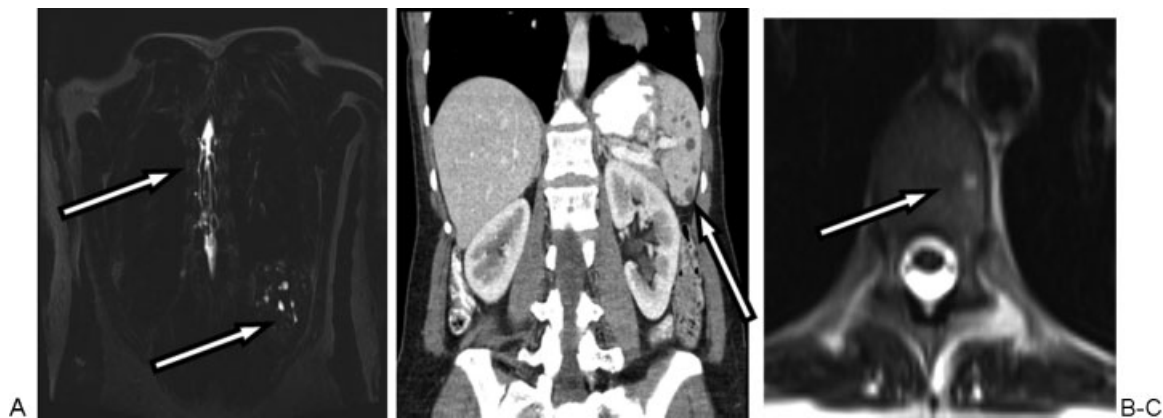
Figure 1 (A) Coronal MRI chest with 3D echo gradient sequences highlighting multichannel lymphatic anomalies within mediastinum and spleen. (B) Coronal CT abdomen showing lymphatic collections throughout the spleen. (C) Axial T2-weighted MRI chest demonstrating lymphatic dilatation in the vertebral body. CT, computed tomography; MRI, magnetic resonance imaging; 3D, three-dimensional.

consistent with diagnosis of GLA (→ Fig. 1 ). Given prior pericardial window and extensive nature of lymphatic channels arborizing throughout the mediastinum, sclerotherapy and coil embolization, rather than extensive surgical resection with high risk of subsequent chronic chylothorax, were performed. The patient underwent intralymphatic injection of 15 units of bleomycin and placement of 14 coils with an excellent lymphangiographic result (→ Fig. 2 ). Following this, drainage of pericardial fluid decreased significantly and the drain was removed. A loculated pericardial effusion has remained stable, without progression or intervention, over the current 14 months of follow-up.