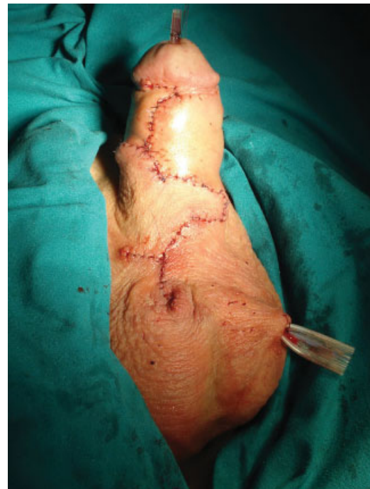
Fig. 6 Appearance at the end of surgery. Penis is straightened and lengthened with urethral meatus positioned at the tip of the glans.

further treatment. Nine patients were sexually active and they reported satisfactory sexual intercourse. One patient developed fistula that was closed 4 months later, while other patients reported regular voiding with no difficulties ( → Table 1 ).