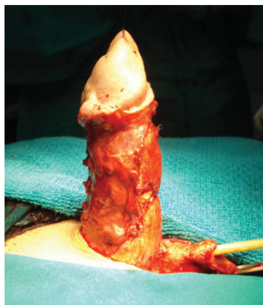
Fig. 3 Corpora cavernosa are joined, neurovascular bundles are placed dorsally, and glans is fixed in proper position. Short urethra is repositioned ventrally at the penoscrotal angle.

thra, which was limiting factor for straightening of the penis, was transected at subcoronal level. Complete straightening of the corporal bodies was achieved by incision made on the dorsal surface of the tunica albuginea, directly opposite to the site of maximal curvature. The defects of the tunica albuginea were closed by bovine or equine pericardium (→Fig. 2). Erection was re-established, and good result of penile curvature correction was confirmed. Corporal bodies were sutured together and neurovascular bundle was fixed on its anatomical position. Urethral remnant was transposed ventrally and urethral orifice was fixed at the base of the penis (→Fig. 3). Gap between glanular part of the urethra and urethral stump was left for the second stage repair. Penile entities were