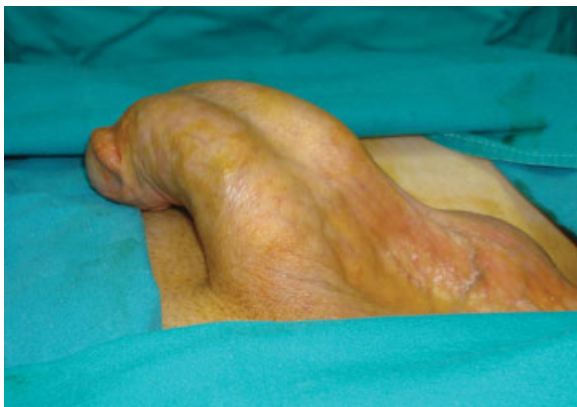
Fig. 1 Appearance of the treated epispadias in childhood. Severe curvature is visible in erect penis.

Standard circumferential incision was made under the glans. Complete penile degloving was performed carefully to avoid injury of the skin. All scars around corporal bodies, from the previous surgeries, were released. After degloving, severely deformed corporal bodies were identified, and the urethra was very short and positioned dorsally. Lifting of the neurovascular bundle began on the ventrolateral side of the penis. After lifting the neurovascular bundle, subtotal glans mobilization was performed for additional release of corporal bodies. Subcoronal plexus of the glans was preserved by meticulous dissection. Separation of the corporal bodies was done along with the dissection of the urethra. In this way, penile disassembly was completed. Artificial erection or erection induced by prostaglandin E1 injection revealed all deformities of the corporal bodies. Short ure-