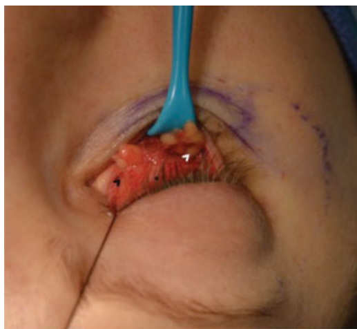
Fig. 2 Transconjunctival blepharoplasty. Inferior oblique (asterisk) separating the medial (black arrowhead) from the central fat pad (white arrowhead).

divided. The flap is elevated deep to the orbicularis oculi and superficial to the orbital septum to the level of the orbital rim. The septum may be transgressed to access preaponeurotic fat if conservative excision is planned. The inferior oblique located between the medial and central compartments is respected during the postseptal dissection (→ Fig. 2 ). From this exposure the surgeon may perform fat transposition, or release the ORL and malar-orbicularis attachments (→ Fig. 3 ).