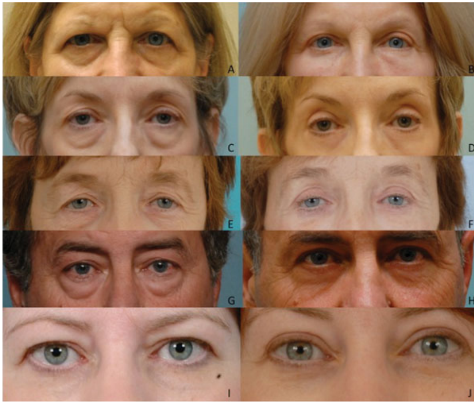
Fig. 5 Before (A) and after (B) skin–muscle flap approach with fat transposition and canthopexy for patient with excess skin and muscle, deep tear trough deformity with thick skin, and positive snap test. Before (C) and after (D) skin–muscle flap approach alone in patient with excess skin and muscle, deep tear trough but thin skin and negative snap test, minimal lower lid distraction, and positive vector. Before (E) and after (F) skin–muscle flap for patient with excess skin and muscle, no significant tear trough deformity, positive vector, negative snap test, and minimal distraction. Fine wrinkling present, deferred trichloroacetic acid (TCA) peel offered but declined. Before (G) and after (H) transconjunctival approach with fat transposition and skin pinch in patient with pseudoherniation of fat, excess skin, and deep tear trough with thick skin. Before (I) and after (J) transconjunctival approach for conservative fat excision in patient with modest pseudoherniation of fat without excess skin, deep tear trough deformity, or fine wrinkling.

avoid contour irregularities. Patients receiving fat transposition routinely undergo release of the ORL and malar orbicularis attachments. Patients at high risk for lower lid malposition in the transcutaneous group receive either canthopexy or canthoplasty, and low-risk patients receive no anchoring (► Fig. 5). 31,32