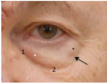
Fig. 1 Surface anatomy, lower lid. 1, tear trough deformity; 2, lid–cheek junction; black asterisk, lateral fat compartment; white asterisk, central fat compartment; arrow, condensation of Lockwood's ligament.

The orbicularis oculi is deep to the skin. 33 It is divided into three parts: pretarsal, preseptal (or palpebral), and orbital. The palpebral orbicularis oculi associates medially with the medial palpebral ligament and laterally with the skin and lateral orbital tubercle. The orbital orbicularis oculi fibers orient circularly about the orbit. They originate from the medial palpebral ligament, frontal process of the maxilla, and inferomedial orbital rim. In the deep lateral plane, a ligamentous attachment, the orbital retaining ligament (ORL), attaches the orbital orbicularis to the periosteum of the maxilla. 12,13,34 The youthful lid has a short vertical height, as the orbicularis complex is without laxity or redundancy and has good tone.