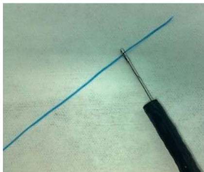
Fig. 1 The dental floss is grasped with a small-sized biopsy forceps.