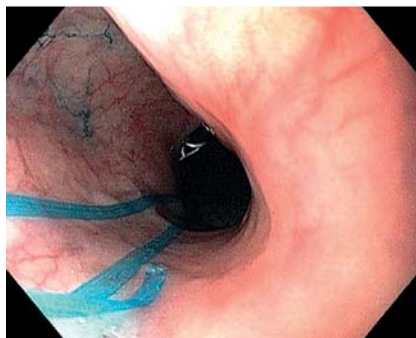
Fig. 3 The dental floss in position.