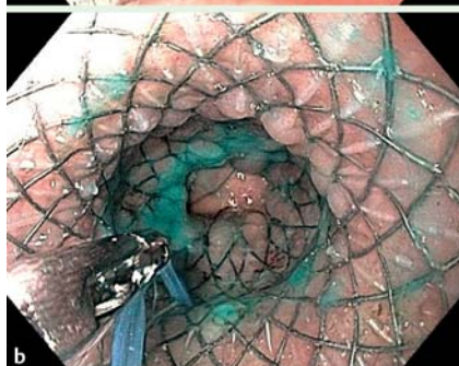
Fig. 2 a The dental floss is passed through the stent mesh from the outside to the inside. b The floss is then carried down using the biopsy forceps.