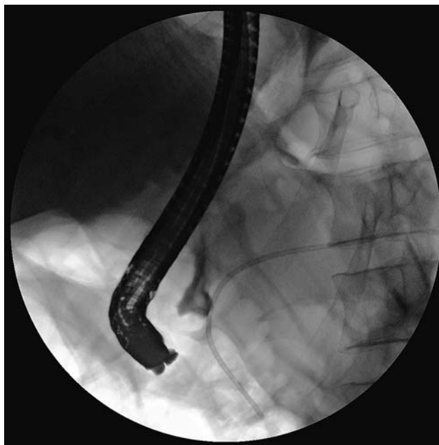
Fig. 3 The bridging pancreatic plastic stent inserted.

Selective cannulation during ERCP can be challenging even in the hands of experienced endoscopists. The double guide wire technique for deep bile duct cannulation with the help of a pancreatic guide wire described by Dumonceau et al. [1], is a well-established technique along with