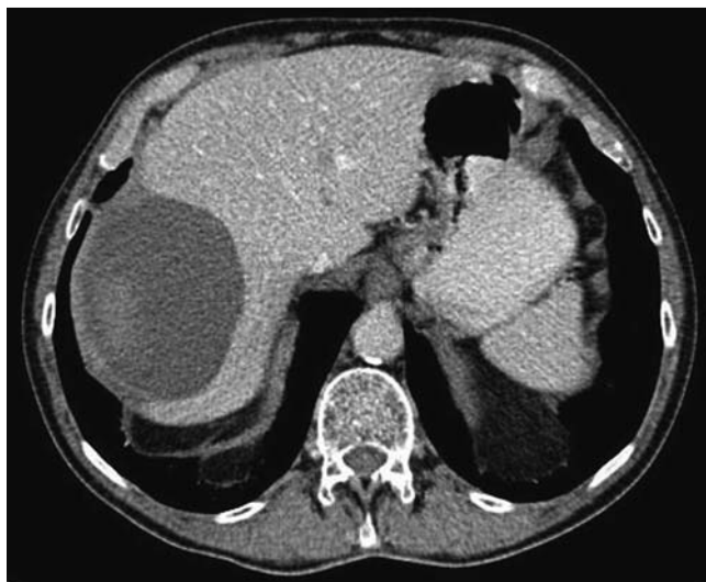
Fig. 2 Follow-up abdominal computed tomography at 2 months showed organization of the hematoma, which was smaller compared with the initial image.

Colonoscopy is a common and relatively safe diagnostic and therapeutic procedure. Iatrogenic injuries have been reported in the medical literature, but the overall risk of serious complications such as perforations and visceral lacerations is low [1–4]. Database studies have shown the total complication rate to be in the range of 2.8 per 1000 colonoscopies, with a mortality rate of 0.007% [5].