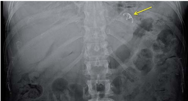
Fig. 2 The scout film demonstrated the “cup-like” formation of the over-the-scope clip (yellow arrow), which was deployed in the gastric fundus after full-thickness endoscopic resection of a gastric gastrointestinal stromal tumor.