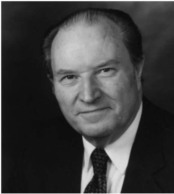
Fig. 1 Eberhard F. Mammen (1930–2008).