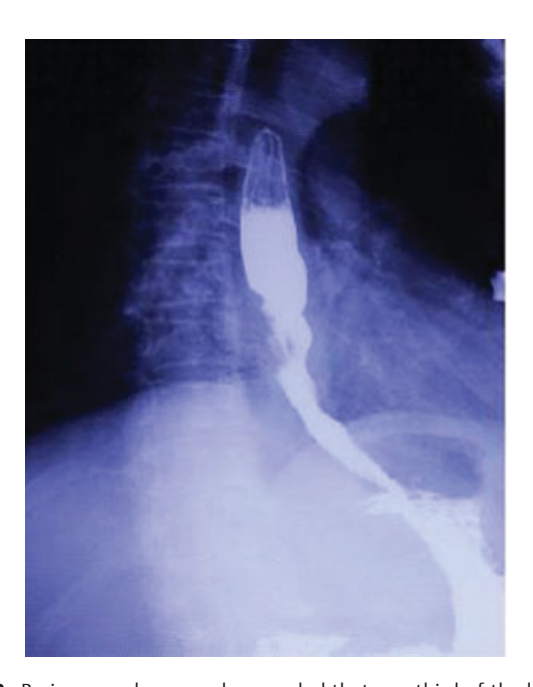
Fig. 2 Barium esophagography revealed that one-third of the lower esophagus showed an approximately 6 cm arc filling defect, local mucosal damages and wall stiffness, and irregularities in lower thoracic esophagus.

micro vascular anastomosis was performed. The remnant stomach appeared rosy with adequate blood supply by the left gastric vessels. Enteral nutrition therapy was made by stoma of jejunum. The operating time was 239 minutes and the estimated blood loss was 380 mL. Postoperative course was uneventful. The integrity of the anastomosis of the esophagogastrostomy was confirmed by water soluble contrast radiography on postoperative day 9, and there was no sign of leakage or stricture. He started a liquid diet the following day and he was discharged on the 13th postoperative day without any major postoperative complications. Histologically, the esophageal tumor was diagnosed as middle differentiated squamous cell carcinoma with tumor-free margins. The gastric tumor was diagnosed as poorly differentiated adenocarcinoma with tumor-free margins. Metastasis was not found in the abdomen and mediastinum lymph node.