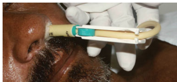
Fig. 2 Securing the Foley catheter in the nose using the valve of the device (a parenteral infusion set).

It is possible to burst the Foley catheter balloon inside the nasopharynx using endoscopy and a perforating instrument. Nevertheless, bursting the Foley catheter balloon may release free fragments of latex. 12