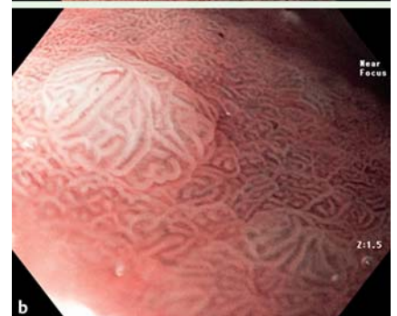
Fig. 3 a, b High-magnification dual-focus narrow band imaging of isolated flat lesions (2 mm diameter) with a subtle villous-like morphology and the appearance of light blue crests.