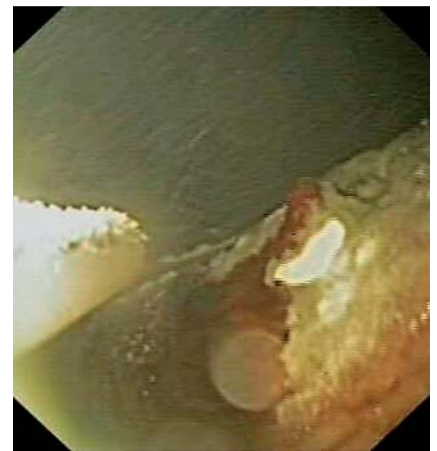
Fig. 2 Endoscopic treatment with Hemospray.