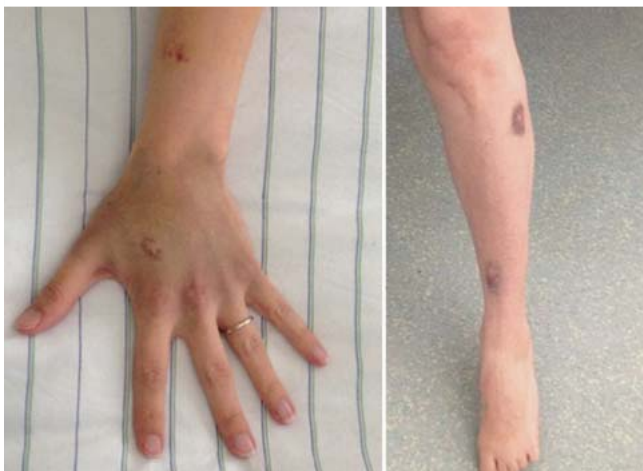
Fig. 1 Spontaneous haematomas shortly after admission of the patient.

branes. Clinical examination did not reveal any further complaints. She did not suffer from headache or upper abdominal pain. Her vital signs were normal. Previous diseases, and coagulopathies in particular, were not known and the family history was inconspicuous. She was not taking any medication. A blood analysis in the first trimester had been normal.