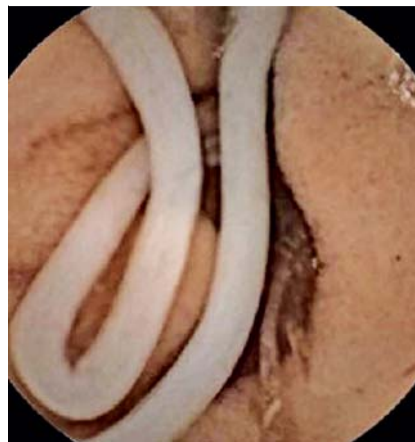
Fig. 4 Hookworms ( Necator americanus ) and a roundworm ( Ascaris lumbricoides ) were revealed on capsule endoscopy.

An 84-year-old woman presented with dyspnea due to an exacerbation of chronic heart failure caused by severe anemia (hemoglobin 4.4g/dL). Colonoscopy revealed a cloud of white worms moving among tarry stool in the cecum and ascending colon. The posterior portions of the worms were located in the colon lumen, while the anterior portions were firmly embedded in colon mucosa (▶ Fig. 1 ). One of the parasites was removed with biopsy forceps and identified as a whipworm ( Trichuris trichiura ).