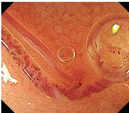
Fig. 3 Magnified endoscopic image of hookworms ( Necator americanus ) in the duodenum. The esophagus, intestines, and reproductive organs of the hookworm were clearly visible. The mouth was attached to the duodenal mucosa, with superficial mild erosion shown in red.