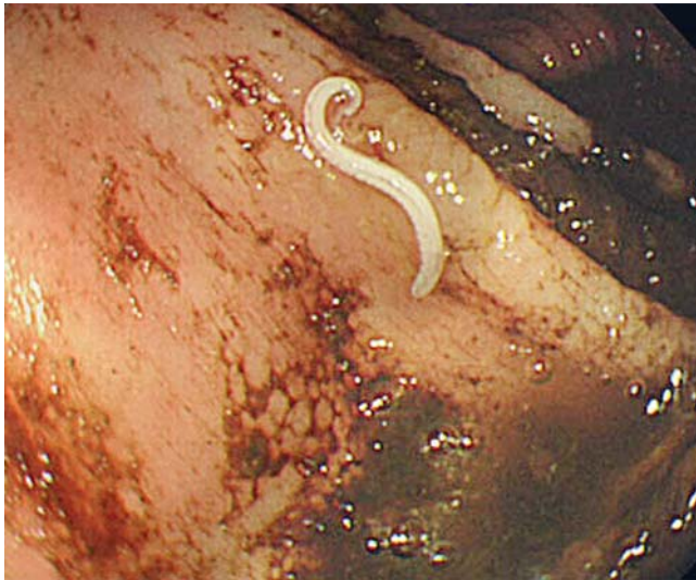
Fig. 1 Endoscopic image of a whipworm ( Trichuris trichiura ) in the colon. The anterior portion was embedded in the colon mucosa, while the posterior portion, with coiled tail, was present in the colon lumen. The intestinal organ of the worm was seen as a gray line. The anterior portion elongated in a rubber-like manner when removal was attempted.