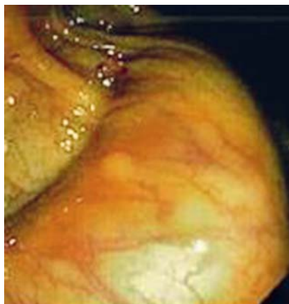
Fig. 1 Colonoscopic view of small sessile polyps throughout the colon.

3 General Surgery, Northside Medical Center, Youngstown, Ohio, USA