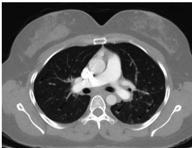
Fig. 3 Chest CT showed numerous nodules in both lungs with mild mediastinal and hilar adenopathy.