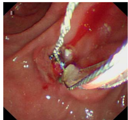
Fig. 3 Stones in the pancreatic duct were removed using a basket.

A 33-year-old man underwent endoscopic retrograde cholangiopancreatography (ERCP) for removal of stones in the pancreatic duct. The stones were removed successfully and a plastic pancreatic duct stent (7 Fr, 10 cm; Wilson-Cook, Winston-Salem, North Carolina, USA) was placed in the pancreatic duct to prevent post-ERCP pancreatitis and obstruction.