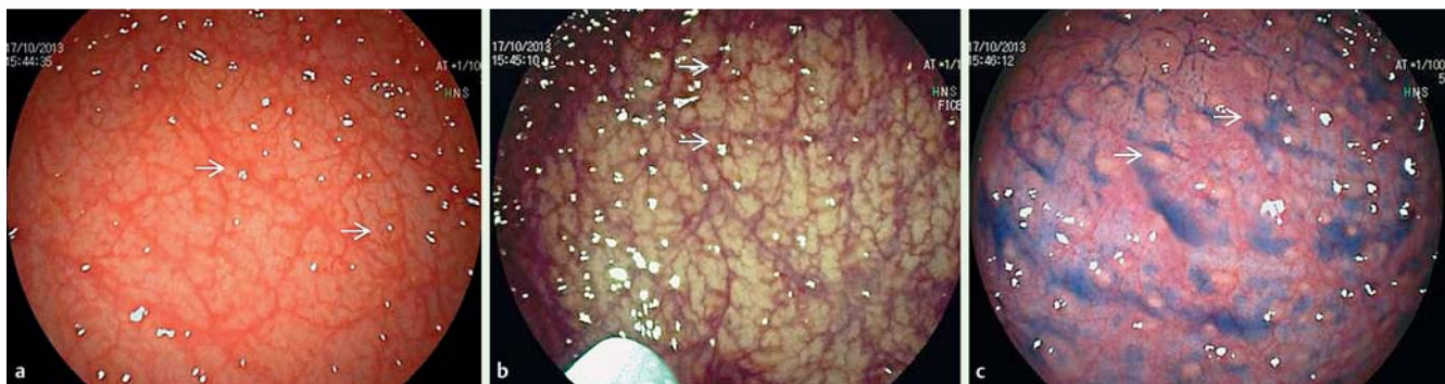
Fig. 2 Rectal double-balloon enteroscopy (rDBE) with the high-resolution CCD (charge-coupled device) chip and FICE (Fuji intelligent color enhancement) showing: a, b an erythematous area of the bowel with markedly increased reddish superficial vessels and an increased number of lymphoid follicles (white arrows); c the appearance on chromoendoscopy with methylene blue.

It has been reported that allergic and immuno-inflammatory disorders are increasing along with irritable bowel syndrome [4]. In this report we have highlighted several functions of this new double-balloon enteroscope (the close focus and zoom functions and the 3.2-mm forceps channel) that can be used along with endoscopic lavage to ensure that such diseases are adequately recognized in the near future.