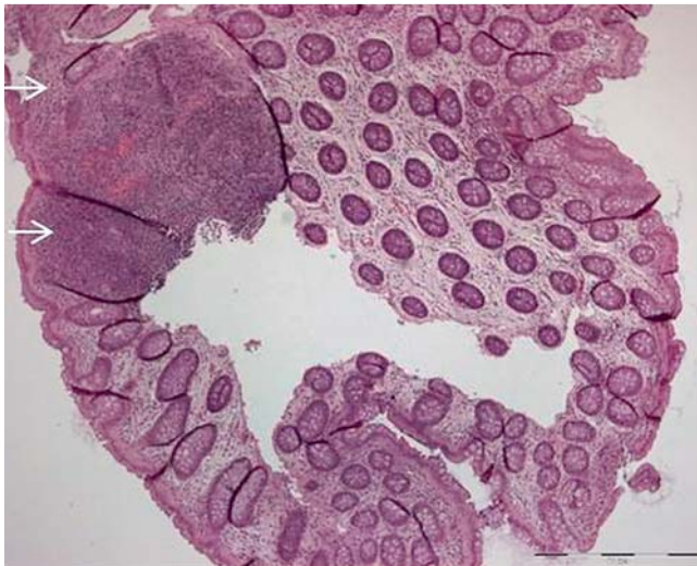
Fig. 3 Histological examination of a biopsy taken from an area that was abnormal on endoscopy showing prominent lymphoid tissue (arrows) directly under the normal epithelial barrier, consistent with the diagnosis of gastro-intestinally mediated allergy.